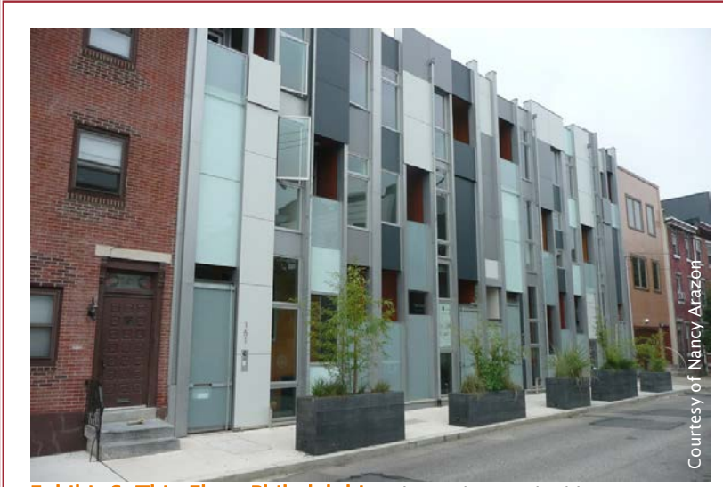
Exhibit 6. Thin Flats, Philadelphia. This eight-unit building in Philadelphia's Northern Liberties neighborhood achieved LEED Platinum certification for its environmentally sustainable features that include a green roof and underground cisterns that store rainwater to irrigate backyard gardens.

The Philadelphia Water Department commissioned a study comparing alternatives for controlling its combined sewer overflows that measured the value of various environmental, social, public health, and other benefits.20 Across all city watersheds, the total net benefits over 40 years ranged from $1.9 billion (in 2009 dollars) for an option that included managing 25 percent of